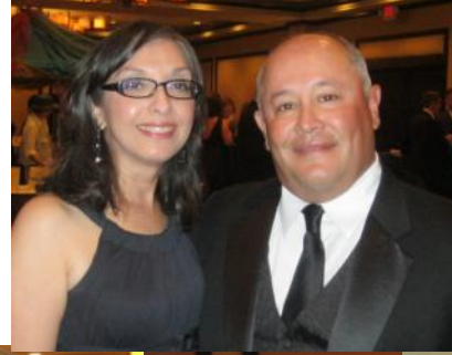
Fancy folks at the Diamond Ball on March 5, to support the West Valley Arts Council.