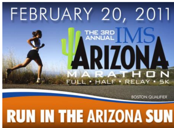
Click the image for more information.