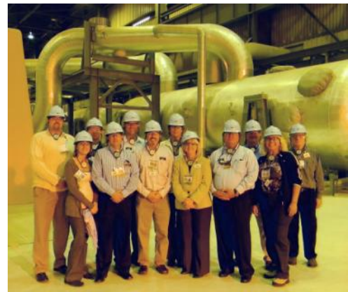
Members of Class 17 on a Focus Tour at APS's Palo Verde Nuclear Generating Station